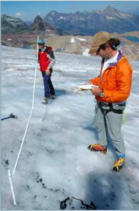
USGS researchers measure glacier mass by inserting ablation (melting) stakes that will be read throughout the summer.

measuring mass lost or gained, aerial photos, area measurements using GPS, and measuring peak runoff (see Glacier Monitoring Studies page on USGS NOROCK site).