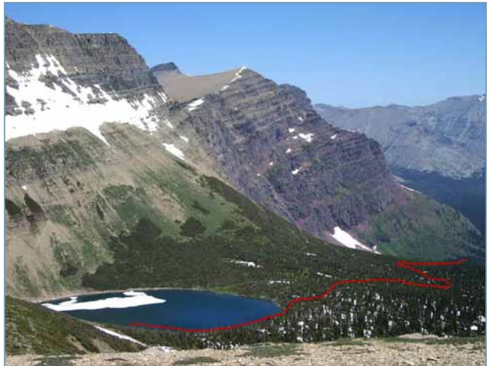
Increasing air temperatures coincide with trees advancing upslope. The red line represents a "former" ecological threshold of treeline. The trees to the right of the line are 600 plus years old, whereas the trees to the left are younger than 80 years.